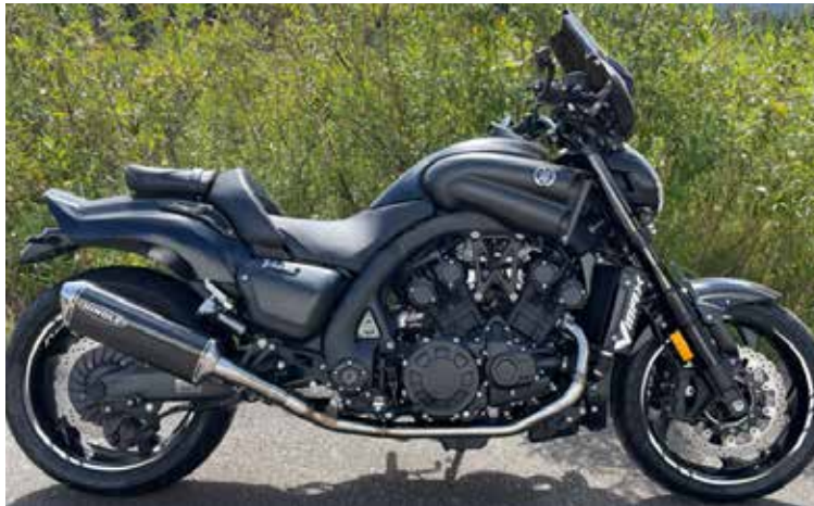
Hindle V-Max 1700 System Installed

Caution: Do not install exhaust while engine is running, and/or is hot to the touch. Thoroughly read and review all steps of installation instructions to ensure proper installation. If you have any questions about installation, please contact us at 905-985-6111 and we would be happy to help.