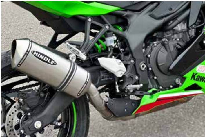
Evolution Muffler Installed

Caution: Do not install exhaust while engine is running, and/or is hot to the touch. Thoroughly read and review all steps of installation instructions to ensure proper installation. If you have any questions about installation, please contact us at 905-985-6111 and we would be happy to help.