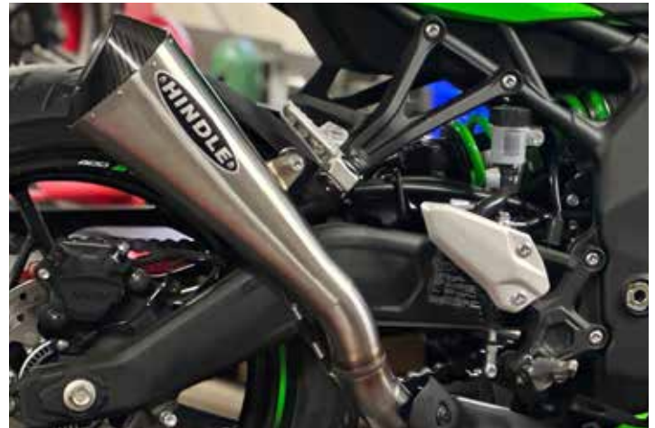
Evolution Megaphone Installed

Step 1: Remove stock muffler and elbow/mid-pipe, as per owner's manual.