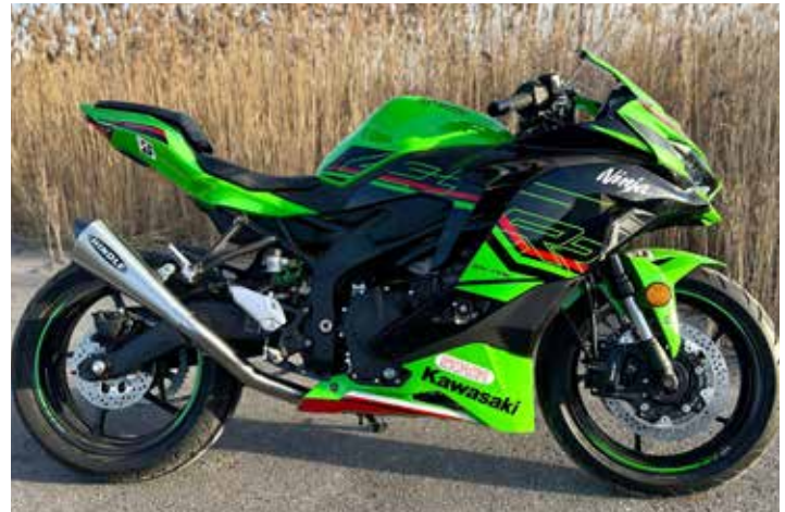
Evolution Megaphone Installed

Step 8: *VERY IMPORTANT* A break-in procedure must be performed for new Hindle mufflers. Once installed, Hindle muffler must be warmed up by running the engine at idle for 15 minutes. Hindle muffler should then be left to cool down for 15 minutes. This process will help prolong the life of your Hindle muffler by helping set the internal muffler packing before first use. Please note: Hindle mufflers require general maintenance: repacking of the muffler should be done, when required. Repacking will help protect the muffler's outer shell, as well as noise and exhaust emissions.