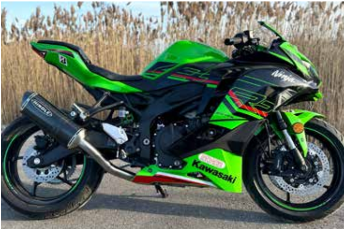
Evolution Muffler Installed