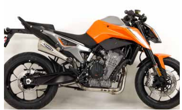
Evolution Megaphone Installed