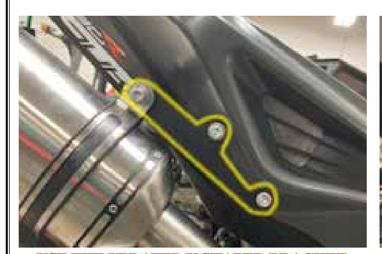
USE THE UPDATED Y SHAPED BRACKET

IMPORTANT UPDATE: THE FULL SYSTEM BRACKET HAS BEEN UPDATED TO A "Y" SHAPED BRACKET. USE "Y" SHAPED BRACKET IN PLACE OF "U" SHAPED BRACKET IN ALL STEPS.