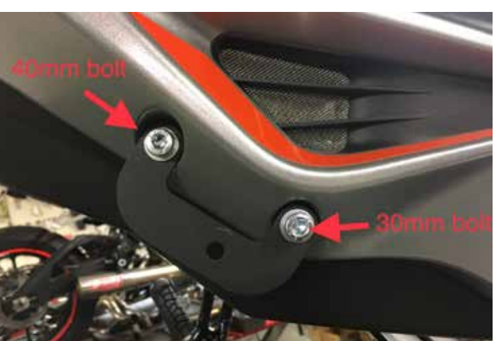
DO NOT USE THE U SHAPED BRACKET