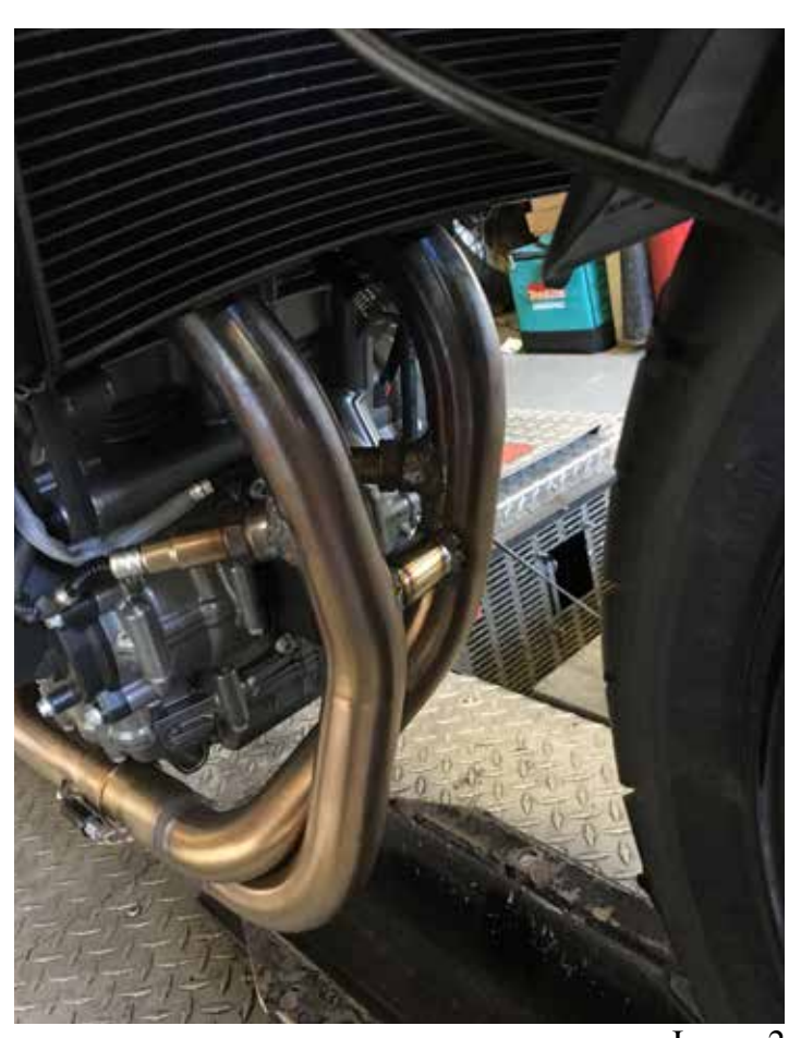
Step 4: Re-install stock 02 sensors onto Hindle primaries. See Image 3. .