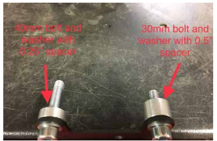
Step 7: If you are eliminating the stock rear foot peg mount, use the "Y" shaped bracket provided. Install the 0.25" spacer onto the 40mm bolt and washer (provided). Install the 0.5" spacer on the 30mm bolt and washer (provided). VERY IMPORTANT: install the 40mm bolt with spacer assembly on the left side of the bracket, and install the 30mm bolt with spacer assembly on the right side of the bracket. See Image 6 and Image 7.