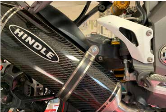
Evolution Muffler Installation - Image 5

For Evolution Megaphone installation: mount Evolution Megaphone directly to bracket with supplied 8mmx-20mm bolt (1), 8mm washers (2) and 8mm nut (1). See Image 6.