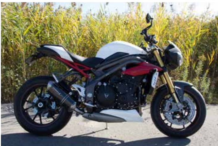
Evolution Muffler Installed

Enjoy the quality and performance of your new Hindle Exhaust System!