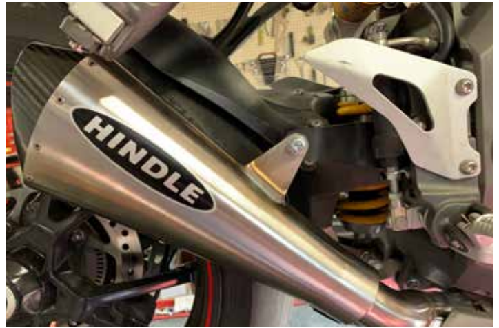
Evolution Megaphone Installation - Image 6

Step 5: Check overall clearance on exhaust installation before start up.