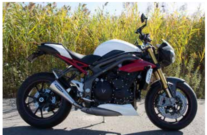
Evolution Megaphone Installed