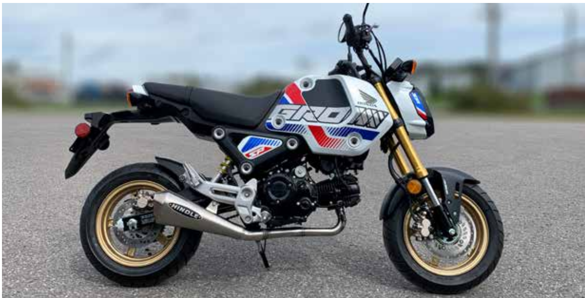
Hindle Evo Megaphone Installed

Caution: Do not install exhaust while engine is running, and/or is hot to the touch. Thoroughly read and review all steps of installation instructions to ensure proper installation. If you have any questions about installation, please contact us at 905-985-6111 and we would be happy to help.