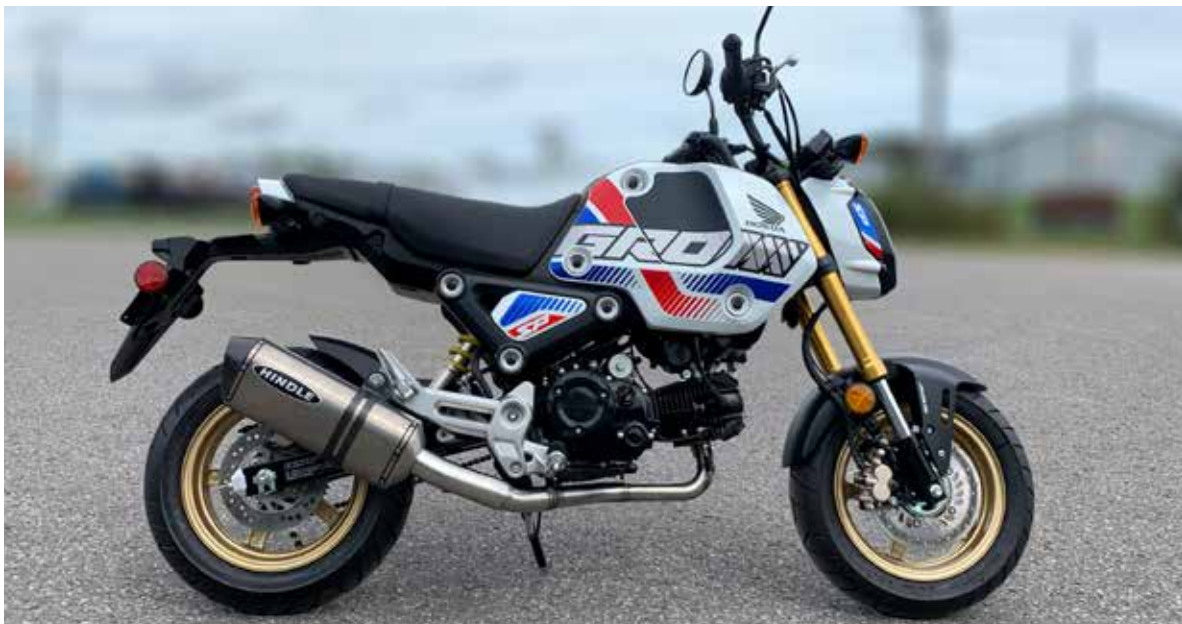
Hindle Evo Muffler Installed