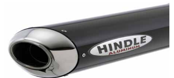
BLACK CERAMIC COATED

YAMAHA NYTRO MUFFLERS; ALSO AVAILABLE IN TITANIUM, & CARBON FIBER