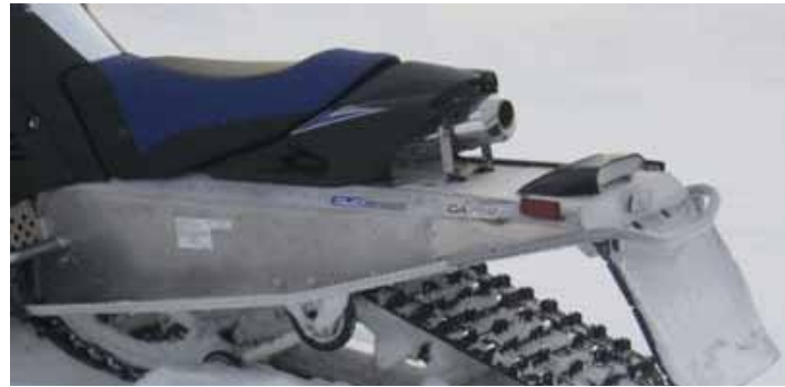
2008-2011 | YAMAHA Nytro Full System (Close-up)