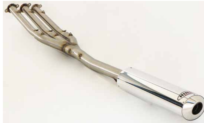
2008-2011 | YAMAHA Nytro Full System