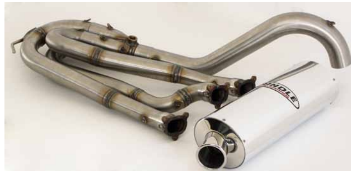
2009-2011 | SKIDOO 1200 Full System